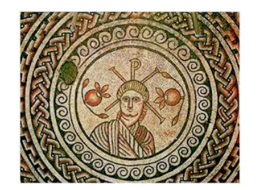
The Mosaic Hinton St. Mary August 2019